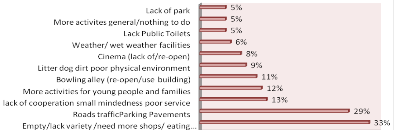
Chart 2: Comments from people outwith Oban on what they dislike/could be improved in Oban

The comments made on what was disliked or could be improved as shown in the chart below.